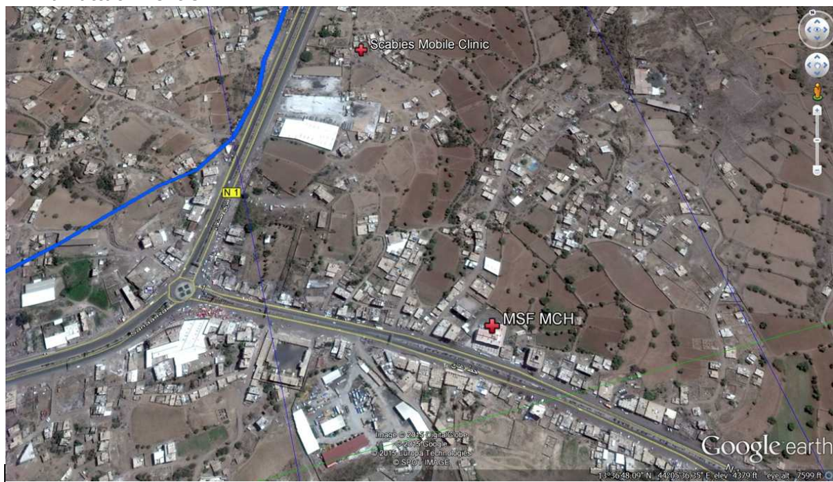
Email attachment 3: