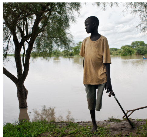
A boy, with an amputated leg after being bitten by a snake, Jonglei State, South Sudan.

Snakebite envenoming is an issue that has been neglected for far too long. Global health agencies, donors, governments and pharmaceutical companies need to share responsibility for putting it where it belongs on the global health agenda, and taking immediate and collaborative action to address this major public health emergency.