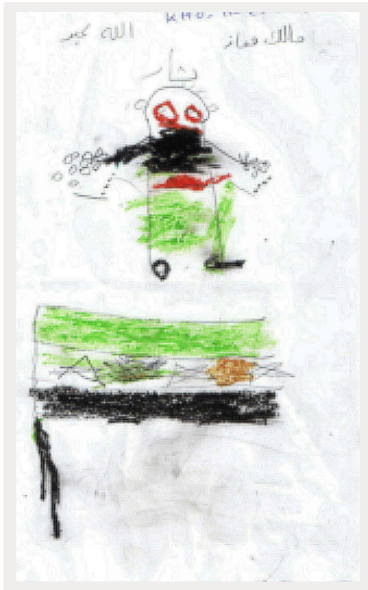
Syrian children's drawings in Kilis